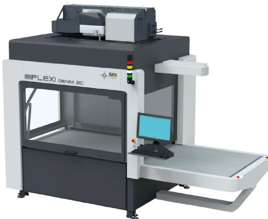
Custom laser preview